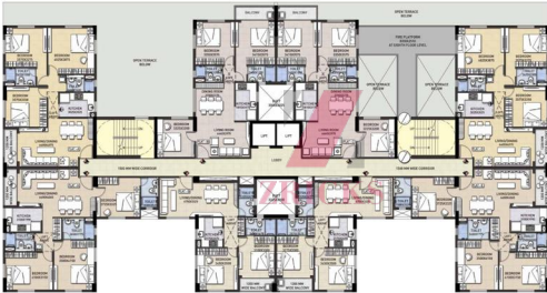
Block 2 Third-Eighth floor plan