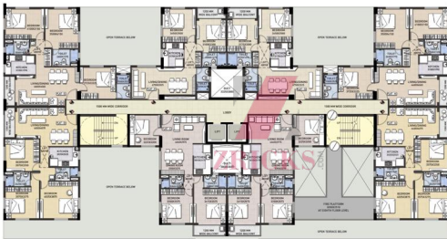
Block 1 Fourth-Eleventh floor plan