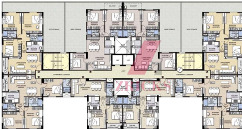
Block 2 Second floor plan