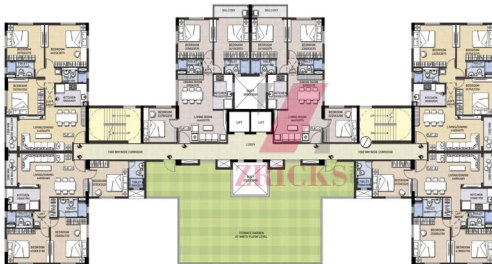
Block 2 North - Eleventh floor plan