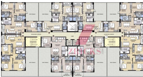
Block 1 Third floor plan